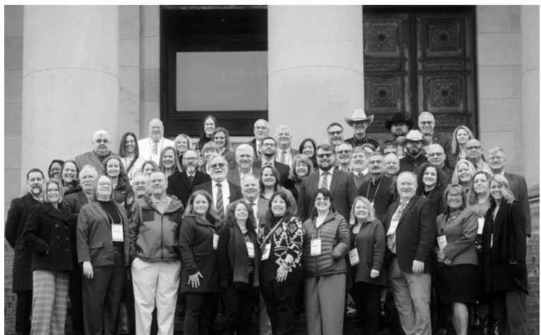
2025 WACO DAY ON THE HILL EVENT