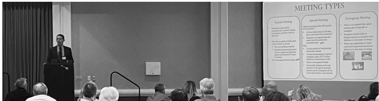
EDUCATION SESSION AT THE 2022 NEWLY ELECTED OFFICIALS CONFERENCE