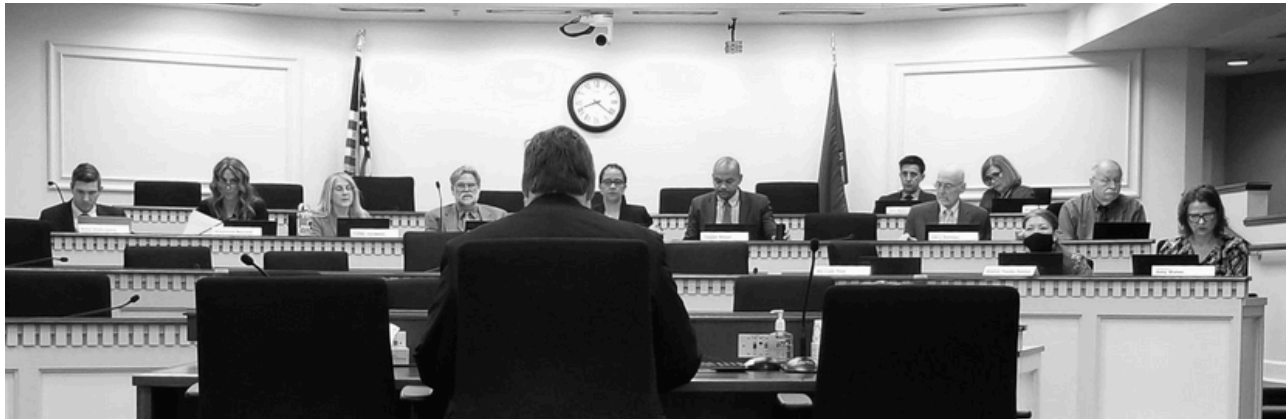
2023 LEGISLATIVE SESSION

Term: 3-year terms; may be renewed once.