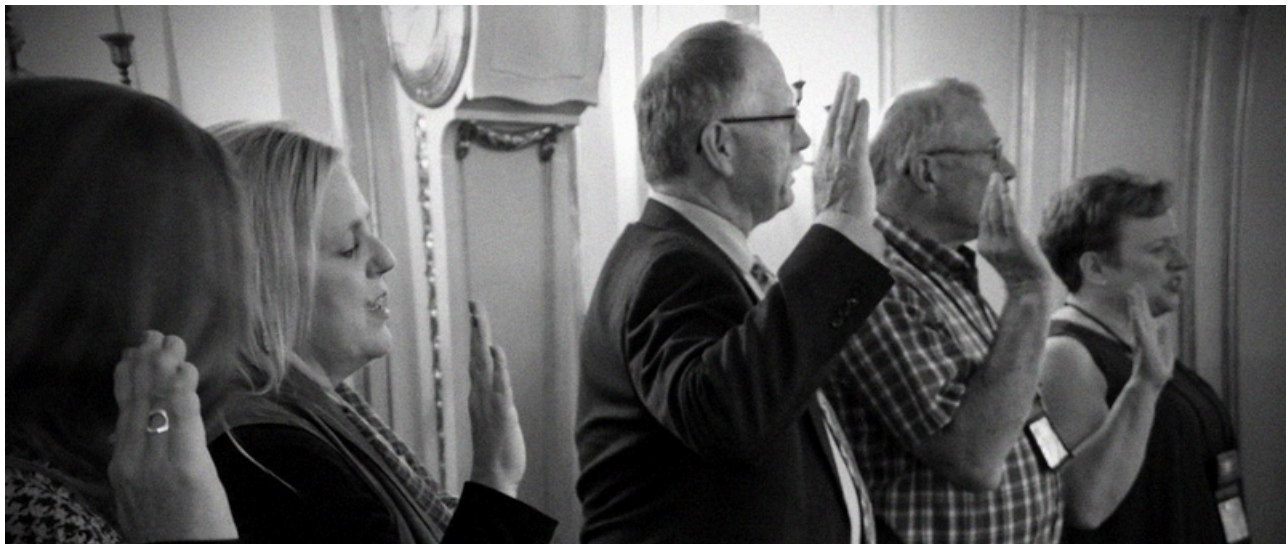
2019 WACO BOARD OF TRUSTEES

The past presidents play an important role in training incoming leadership and in ensuring continuity of policy and practice.