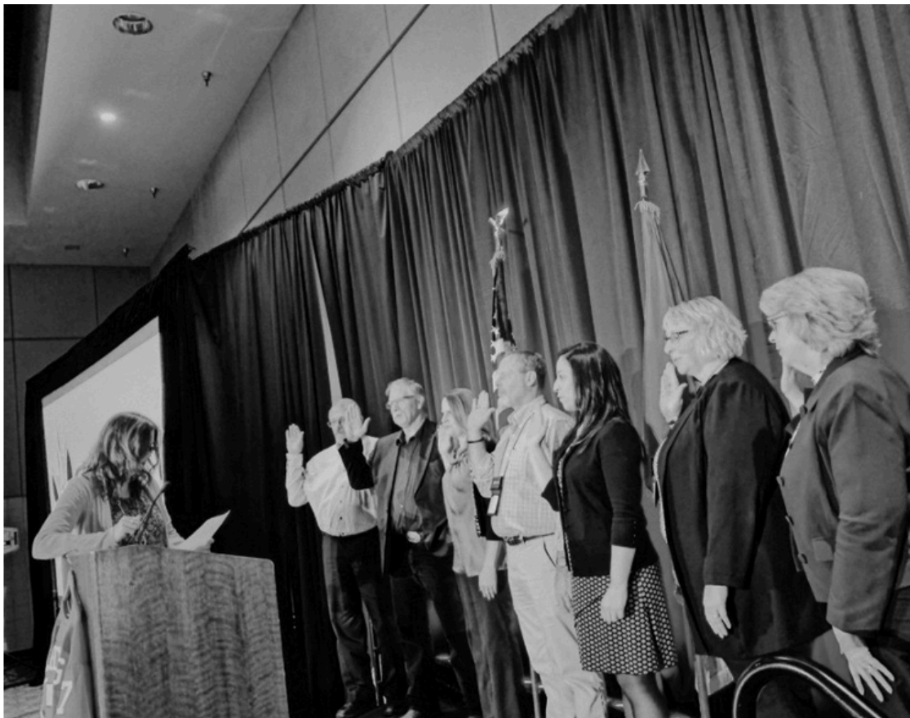
2020 WACO BOARD OF TRUSTEES

3-4 brief meetings between August and late September to review nominees and applications from candidates for WACO Board of Trustees – 3 hours total