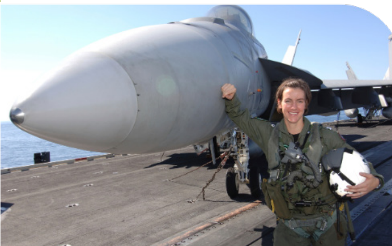
Retired Naval Officer, 2004 TOPGUN graduate